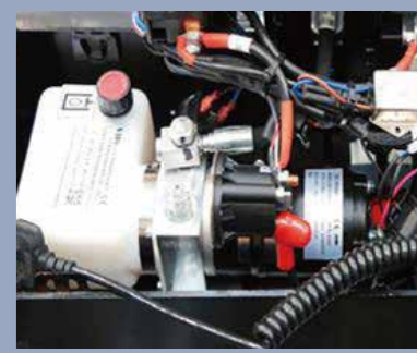
Integrated hydraulic unit, compact structure, less space