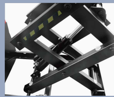
Double scissors structure, rectangular tube profile, more stable and stronger

/ The battery is removed from the side of chassis, One piece plastic cover, easy to maintaining.