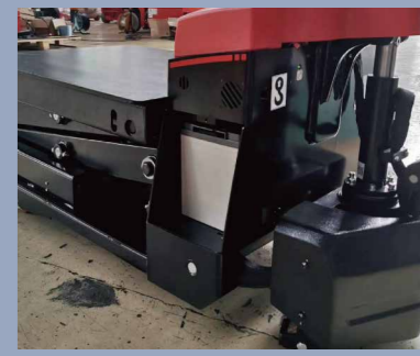
The batteries can be removed conveniently, for easier maintenance and disassembly