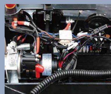
One-piece cover, covering almost all important components, convenient for maintenance